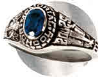
STERLING SILVER $60