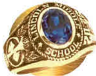
GOLD PLATED $80