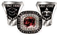
THE WORKS $195